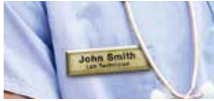
Label to look professional