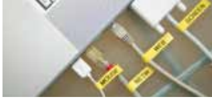
Label to organize and identify

Whether you need one or a hundred labels at a time, a Brother P-touch PT-P750W will help ensure your day-to-day work runs as efficiently as you need it to. And with the wide variety of tape widths and colours available you're sure to find one suitable for your needs.