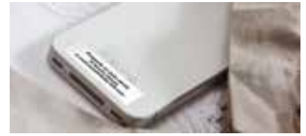
Label to protect your assets