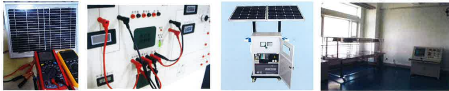
Solar Educational Equipment