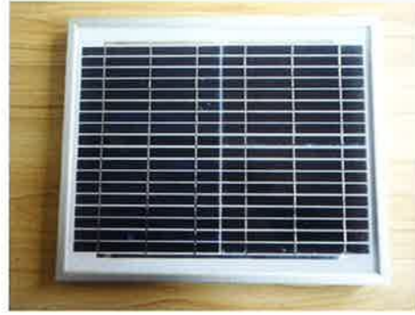
Solar Modules Pictures