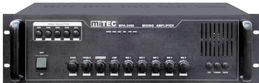
MPA-2400 240W(rms) MPA-3600 360W(rms) 19" Standard Rack-Mount

440W x 94H x 340Dmm ( MPA-600, 900 ) 482W x 145H x 340Dmm ( MPA-1200, 2400, 3600 )