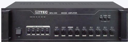
MPA-1200 120W(rms) 19" Standard Rack-Mount