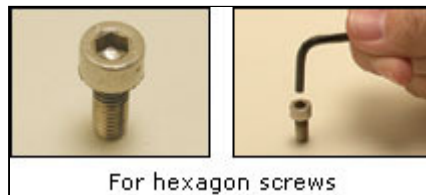
For hexagon screws