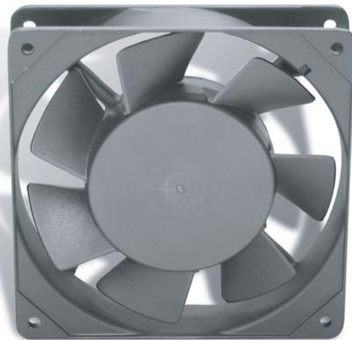
Frame Type: Aluminum painted & Plastic UL94V-O Impeller: Thermoplastic UL94V-O P.B.T.