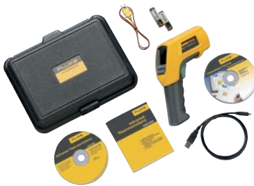
The Fluke 568 and included accessories