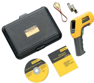
The Fluke 566 and included accessories